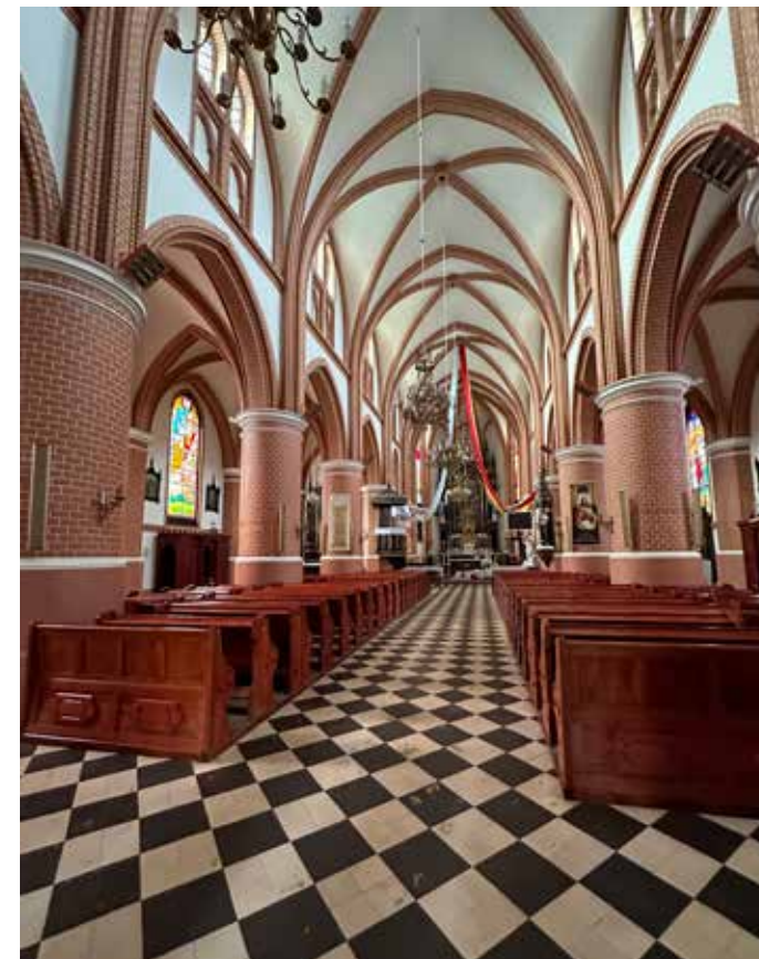
Above: Kaluszyn's Catholic church where Jewish residents of the town were rounded up and held before being shot to death in the cemetery. Below: a panoramic view of the new Jewish cemetery. This area was the site of a pair of mass shootings that took the lives of as many as 1,300 Kaluszyners.

Transport to camps like Treblinka gave German authorities a chance to lie to Jews in ways that would make it possible to steal all their valuables. They were told that they would be relocating to the east and should bring just what they could carry, but certainly the best of what they had. This had the tendency to fill suitcases, pockets, and the seams of clothing with what little material wealth belonged to these victims. Killed in camps behind barbed wire, the Germans had every chance to devise systems that would strip