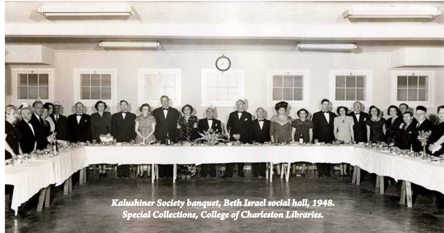
Kalushiner Society banquet, Beth Israel social hall, 1948.