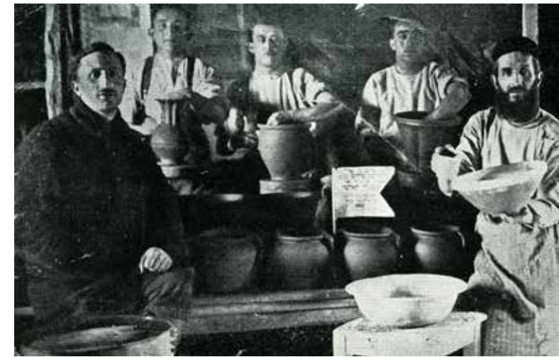
This page and previous: snapshots from Sefer Kalushin .

During the 19 th century, the population of Kaluszyn, both Jewish and Catholic, grew by leaps and bounds, with a reported 8,428 residents by 1897. The percentage of Jews ranged from 76 to 87 percent, and they made their living in a wide variety of occupations, situating families on rungs up and down the economic ladder. 9 Many were artisans, crafting shoes, hats, furs, clothing, and the product Jewish