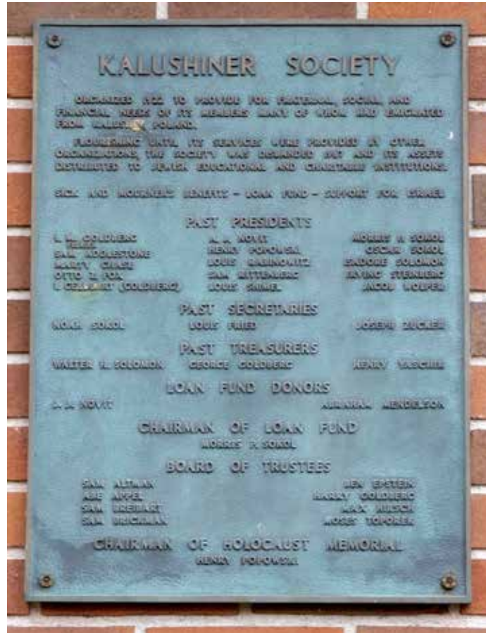
Kalushiner Society plaque placed in 1972 in the courtyard of Charleston’s Jewish Community Center.