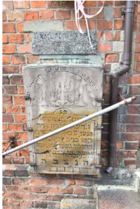
Above: a headstone recovered from the Jewish cemetery is mounted on an exterior wall of the Catholic church (below) in Kaluszyn, Poland.