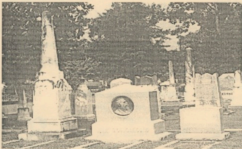
View of Hebrew Cemetery in Sumter, SC, visited by delegates to regional meeting

For further information, contact the Jewish Studies Program at the College of Charleston at 803-953-5682.