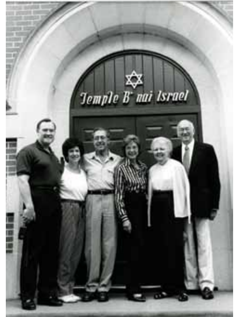
Members and friends celebrate Temple B'nai Israel's 50th anniversary, June 1998.

Participation in Sabbath services dwindled in the 1970s and '80s. Perhaps to attract more members, B'nai Israel joined the Reform movement, a move that appears to have led to a return to regular Sabbath services. Temple B'nai Israel's official affiliation with the Reform movement, however, was brief. The congregation did not maintain its relationship with the national