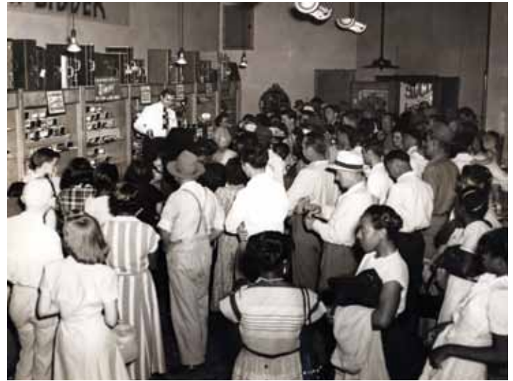
A raffle on opening day at Draisen's Jewelry Store in Anderson, 1948.