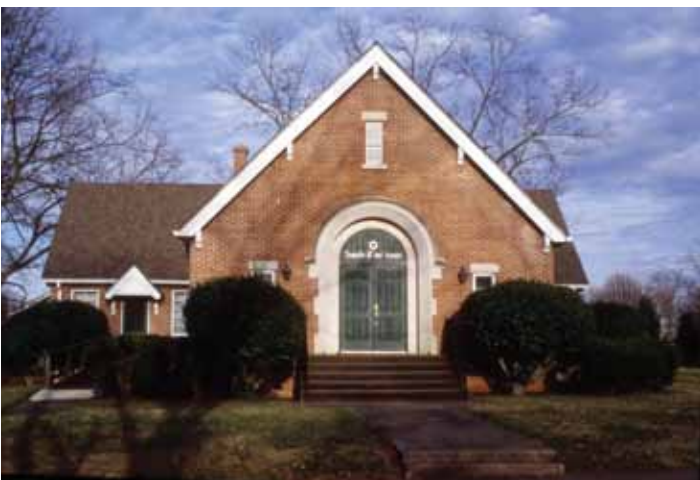
Temple B'nai Israel, Anderson, SC, 1997.