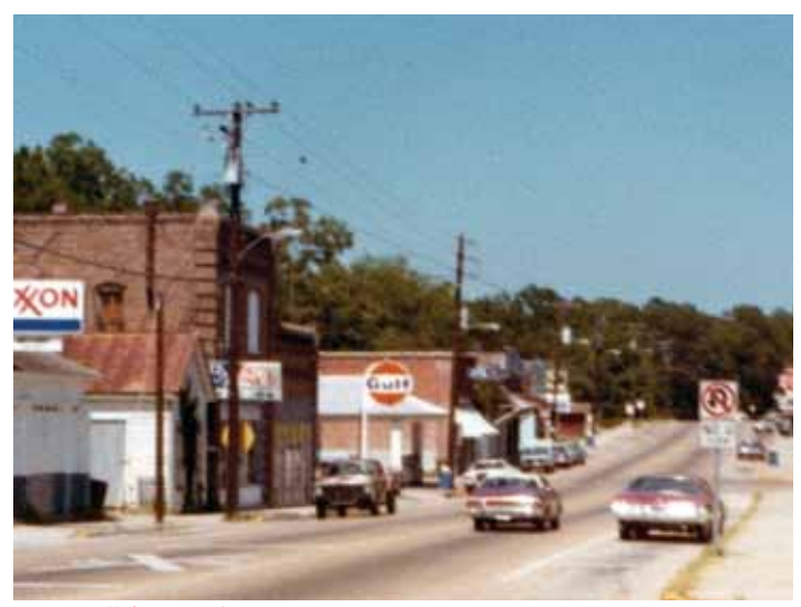
Eutawville's main drag, 1970s.