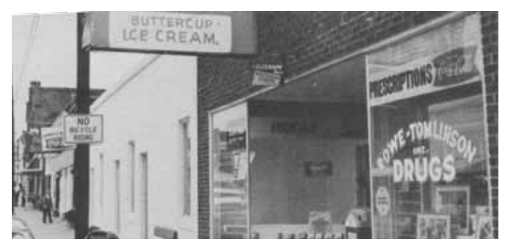
Rowe-Tomlinson drug store.

Dad retired from the town council in 1981 but did not disengage from public life. When I was a youngster, we had the traditional old country doctor who made house calls. After he retired, however, the closest physicians were ten miles away—an obvious hardship for many locals who had limited transportation. Dad spearheaded a committee to attract a physician to the town and obtain funding to open a medical clinic.