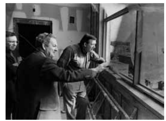
Sumter council members check on the progress of a building project.

exposure to Sumter's civic affairs and became convinced that local government needed to take a more energetic role in promoting industry and creating jobs. In 1958 Dad decided to run for city council. He prevailed over a crowded field, winning a runoff against a member of an established Sumter family.