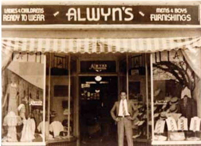
Alwyn's at 914 Front Street, Georgetown, SC, 1949. A customer poses in front of the store about 11 years after it opened its doors.

tough. If you excluded people, you wouldn't be in business long."