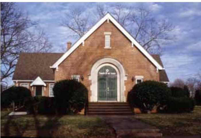
Temple B'nai Israel, Anderson, SC, 1997.