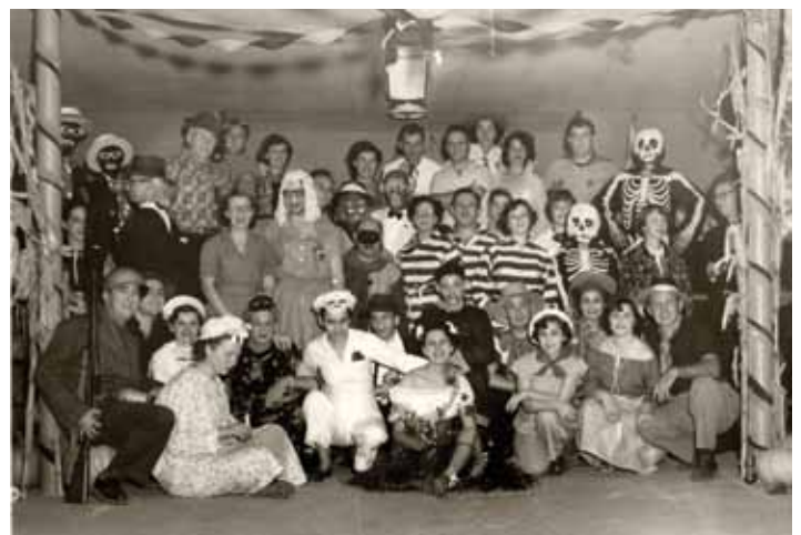
Spartanburg's Temple B'nai Israel Sisterhood Thanksgiving play, ca. 1960.