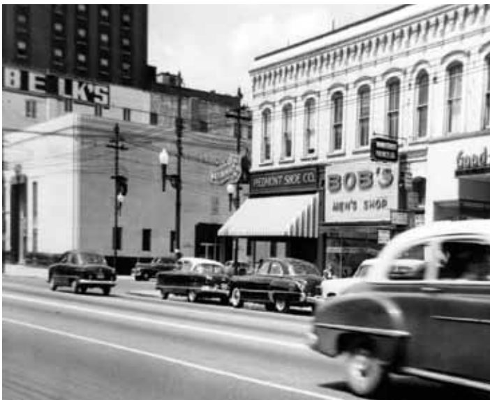
Front of Bob's Men's Shop, 32 South Main Street, Greenville, SC, late 1950s.

At age 14, I entered the newly built Wade Hampton High School. Separating from my junior high friends was at first unnerving and, as one of only four or five Jews, I sometimes felt like the odd man out. With the notable