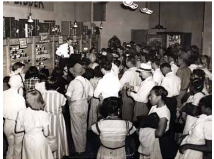
A raffle on opening day at Draisen's Jewelry Store in Anderson, 1948.