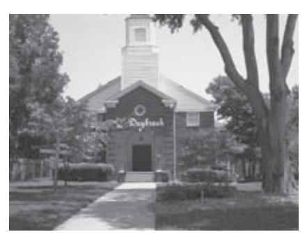
Old Temple of Israel

That history is also complex, however, in that Greenville's Jewish community may be seen as a microcosm of the larger trends in American Jewish life. The 20th century saw Greenville go from having an orthodox congregation and a kosher butcher to having neither today, from 22 Jewish retail stores on Main Street to none today, and from a city which at mid-century had two Jewish physicians and one lawyer to over a hundred Jewish professionals of all types. It has seen Greenville go from a tightly knit community, an island in a fundamentalist Protestant sea, a community where the synagogue was the center of religious and social life (I have it on good authority that congregational meetings at Beth Israel occasionally became so heated that chairs were thrown), to an assimilated community at ease in a more tolerant larger society, with the synagogoue moving to the periphery of concern, and at least half the Jewish population having no affiliation with traditional Jewish communal institutions.