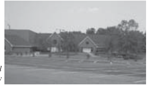
Temple of Israel today

The history of Greenville Jewry is both an easy and a complex subject. It is easy because it is short. Although individual Jews are known to have lived here in the 19th century, and there was even an Eleazer Elizar who was postmaster of Greenville in 1794, Jewish life, which is traditionally communal life, did not begin until the 20th century. The founding of Congregation Beth Israel in 1911 and the Temple of Israel in 1916 are the first events recorded of Jews in Greenville organizing to live as Jews, with other institutions following—a B'nai B'rith lodge in the early 1930s, a cemetery in 1938, a chapter of the National Council of Jewish Women in 1939, and Greenville Federated Jewish Charities in 1945—altogether a history of less than a hundred years.