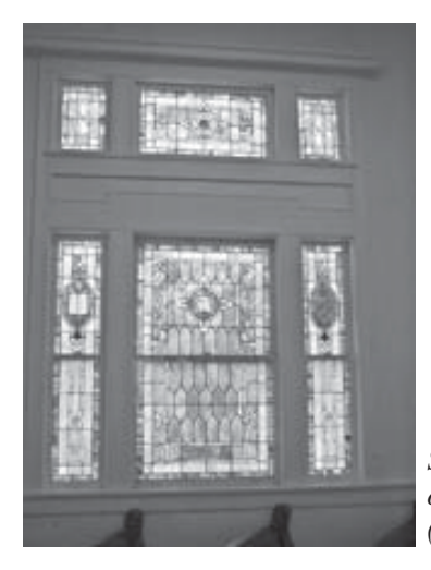
Stained glass windows in the original Temple B'nai Israel (Dean Street synagogue)

In the summer of 1917, the Temple B'nai Israel Jewish Community opened and dedicated its first synagogue on South Dean Street (at its intersection with Union Street) in Spartanburg, South Carolina. A marble tablet was attached to the main wall of the temple foyer to commemorate the event. The tablet was removed from that original building (which still stands) when it was sold in 1961. Two years later, when the current sanctuary on Heywood Street was built and dedicated, the plaque was fastened to one of the outer walls. As you face the tablet, the left column contains the names of those members of the temple who served on the building committee for the original synagogue building. The right column lists the other members of the temple in 1917. As a sign of those times, only men's names are listed.