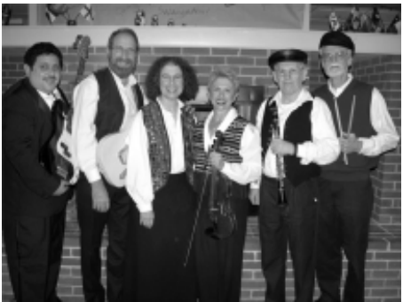
Friends of Klezmer at Presbyterian College, November, 2003

Presbyterian College's Southeastern Center for Intercultural Studies, in Clinton, South Carolina, has chosen as its theme for the 2003/04 academic year "Jews in the South." Founded in 2002 to address a pervasive issue in American higher education – the tendency toward provincialism and ethnocentrism – the Center aims to help students understand their place in the world and better appreciate the cultures, views, and faith of those who differ from the typical Presbyterian College student.