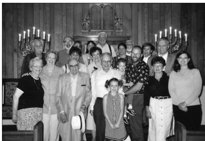
Members of Temple Beth Elohim — Georgetown, SC, May 2003.

But a revival happened. No wailing and crying, no baptisms and shouting preachers. Quietly. One step at a time. Renewed attention and religious interest from a new set of people. As we all know, the Grand Strand is booming and along with the general populace, many Jews are moving here too. And some of these Jews are seeking a Reform congregation. Scraps of paper surfaced, with the names and numbers of previous visitors to Temple Beth Elohim. Phone calls were made. Word began to spread, and people began to come.