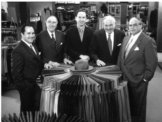
Lourie's Men Store, Columbia, SC, 2000.