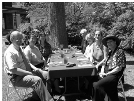
Picnic at Sumter County Museum