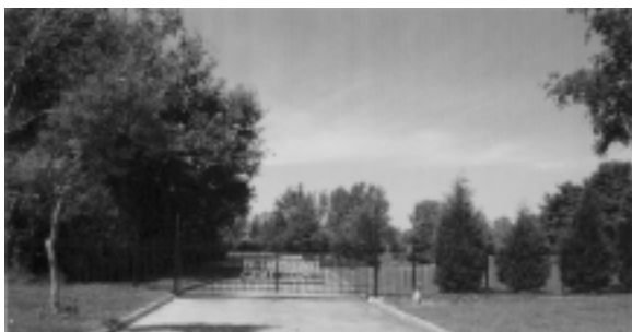
Entrance to Beth Israel Cemetery, Greenville.