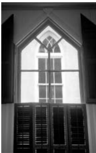
Beth Israel sanctuary window frames the Beaufort Arsenal window next door.