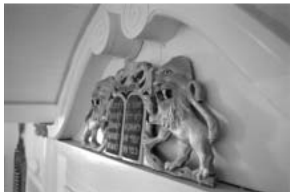
The Ten Commandments on the bima.