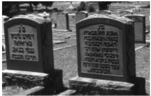
Sons of Israel Cemetery, Aiken.

We need people with a variety of interests, skills, and abilities to help collect data, take photographs, and write, edit, and proofread survey reports before they are published. Please join us in this intriguing and important collaborative effort. Not only is it the first major grassroots effort of the JHSSC, it is the highest form of mitzvah because the dead will not be able to repay us for our efforts.