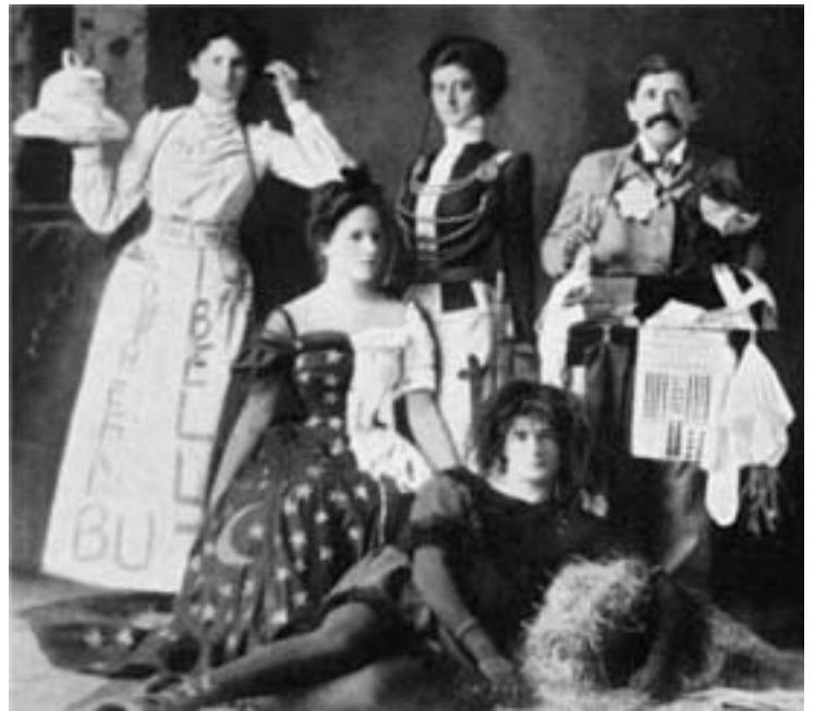
Grand Purim Masquerade Ball, Hebrew Benevolent Society, Orangeburg, SC. Prize winners of 1901: Julia Peterkin, who later would win a Pulitzer Prize for her vernacular novel, Scarlet Sister Mary, is seated second from the left.