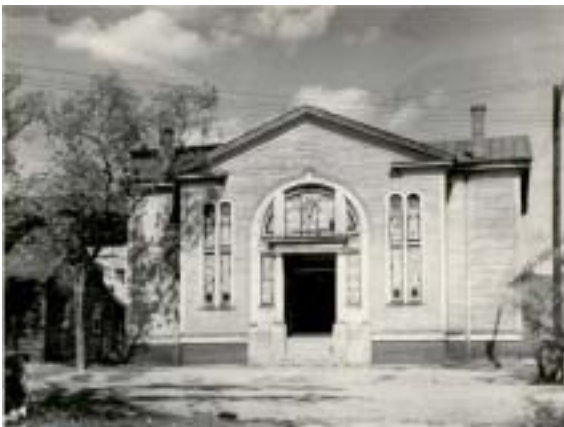
"The Big Apple," Beth Shalom's first synagogue, now on Park Street.

1 mikvah, 2 cemeteries, 10 (or more) rabbis, 50 presidents, 68 years of Sisterhood, 350 family members and 100 years of mitzvahs. Beth Shalom of Columbia, South Carolina, will mark its centennial with a year of inspiring events. Distinguished speakers and guests will join our congregation throughout the year to remember the past and to envision the future of Beth Shalom Synagogue. The Jewish Historical Society of South Carolina will hold its fall meeting in Columbia to honor the congregation. Please mark your calendars and plan to join us!