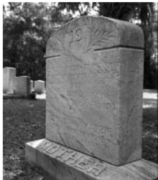
Gravesite of Bessie Katzif, Beth Israel Cemetery, Beaufort.