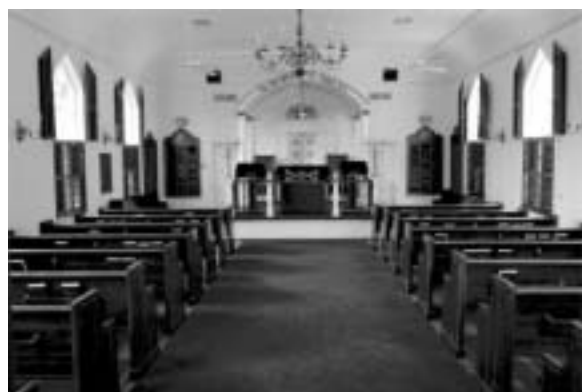
View of Beth Israel looking east to the bima.

This year, Beth Israel Congregation in Beaufort is celebrating the 100th anniversary of the signing of its charter. The Jewish Historical Society of South Carolina has scheduled its spring meeting in Beaufort for the weekend of April 1–3 to be on hand for Beth Israel’s rededication and other festive events. There will be lots of activities commemorating the anniversary, with families using it as an opportunity to hold reunions, thereby highlighting the central place that Beth Israel has played in the life of the Beaufort community for the last hundred years.