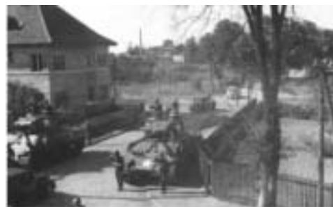
102nd Division meets Russian troops in Gardelegan, Germany, May 1945.