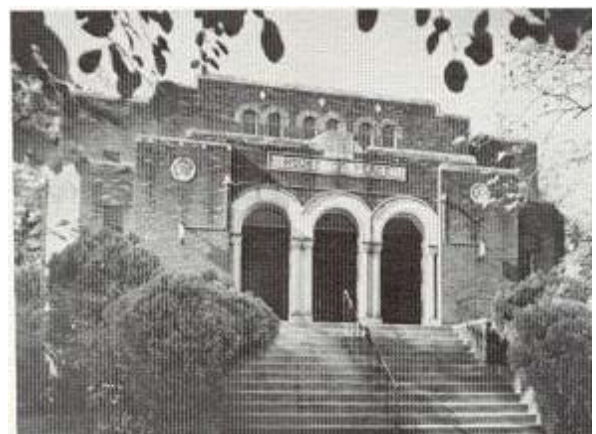
Beth Shalom's second synagogue on Marion Street, demolished some time ago.